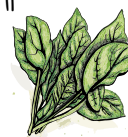
April LEAFY GREENS