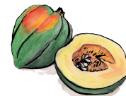
December WINTER SQUASH